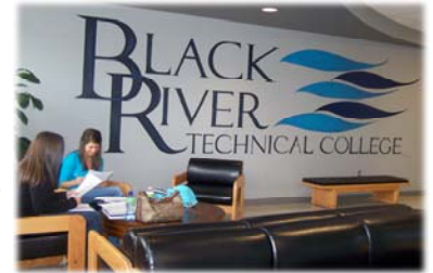
Students utilize the lounge area of the new Academic Complex on the Paragould campus.

making possible for the first time the completion of an entire Associate of Arts degree on the Paragould campus.