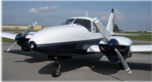
Piper 23-250 Aztec purchased for the Aviation Program.

Black River Technical College's Aviation Maintenance Technology Program recently purchased a fully operational and flight capable Piper 23-250 Aztec plane as part of a $2.9 million grant from the U.S. Department of Labor. The grant was given to the two-year colleges comprising Arkansas' Aerospace Training Consortium and is expected to be used in supporting the development and expansion of Aerospace Industry skills training over the next three years, according to the Arkansas Association of Two-Year Colleges (AATYC) Web site.